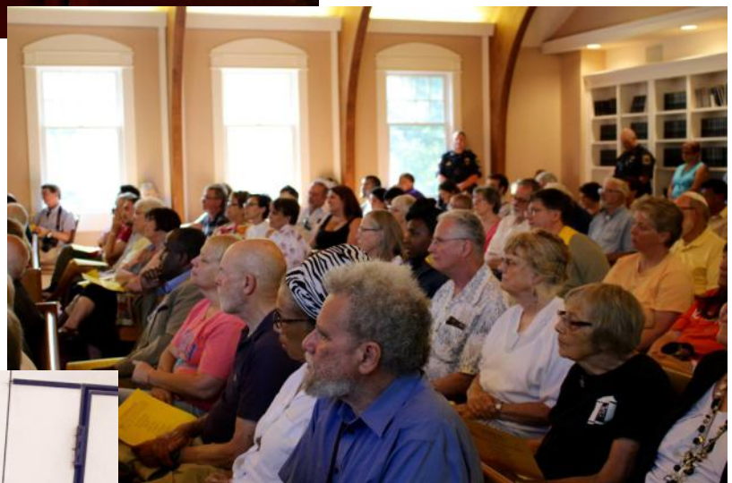
Some of the crowd that turned out for the community vigil. It quickly became standing room only. The Mayor, members of the Police force and over 25 UUs from UUSO attended.