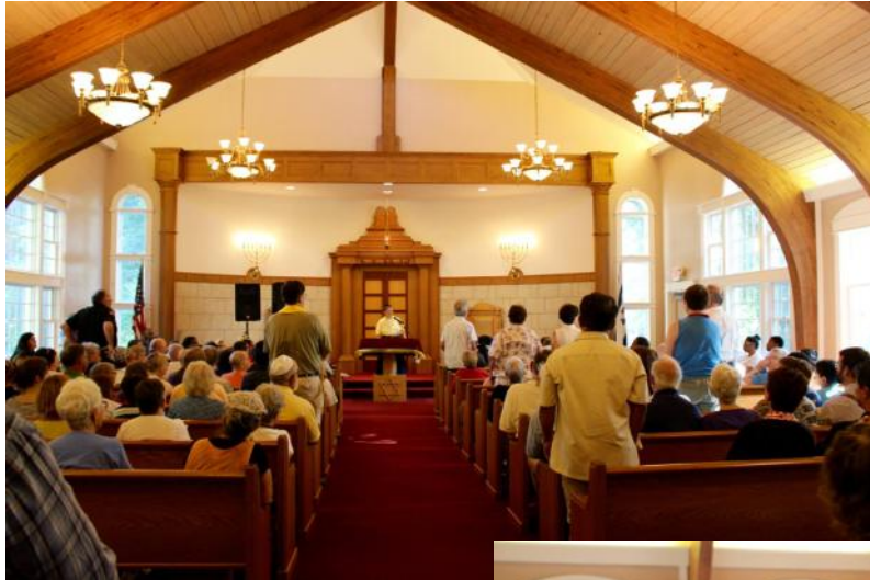
Those standing represent the different faith communities that attended the vigil this past week at Temple Beth El, in honor of the recent victims of the police shootings in Louisiana and Minnesota and the sniper shooting targeting officers in Dallas.